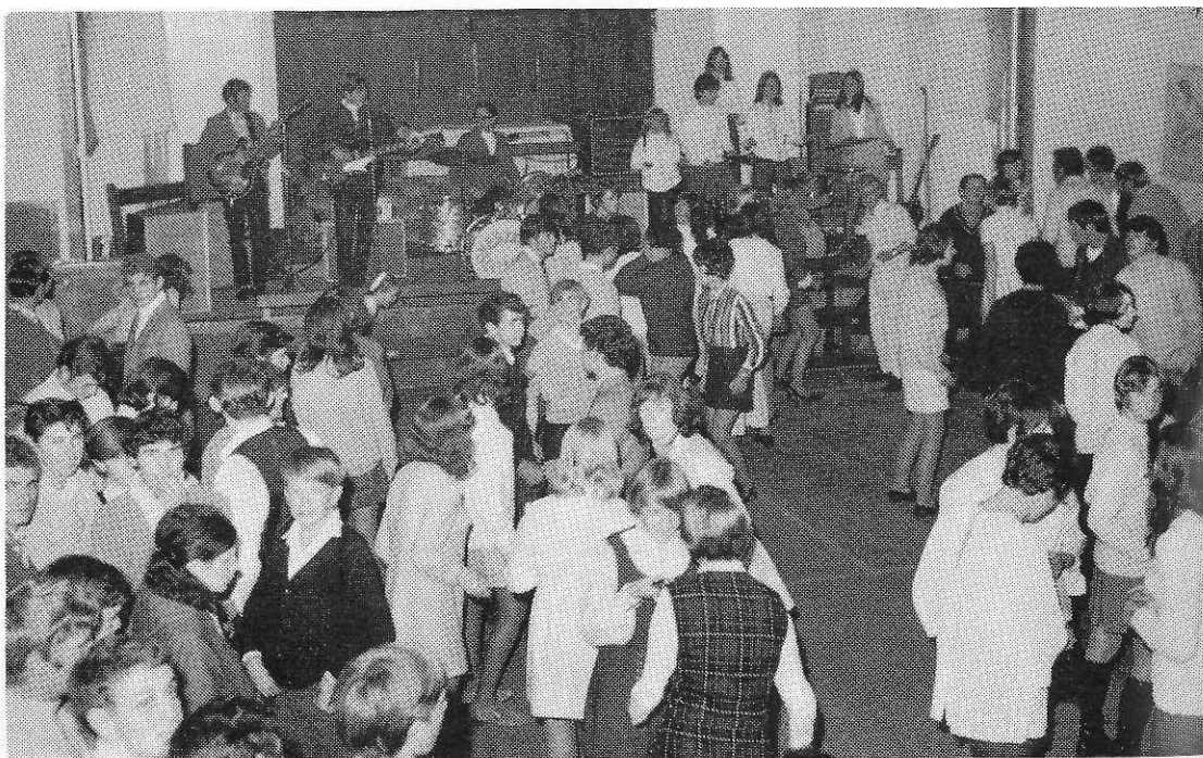
FRIDAY EVENING, 9.30 p.m.

the parish from its apathy and reveal the need of an 'alive' church within the community. By 1944 the balance sheet was the most satisfactory for many years and the 425 communions made that year established a new yearly record. In 1947 the Vestry voted £5 to form the nucleus of a building fund, for the future St. Barnabas Hall. A problem which had dogged the footsteps of rectors for many years was at last tackled in earnest.